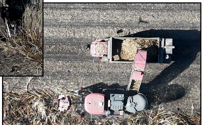
Figure 6. Note the straight tracks