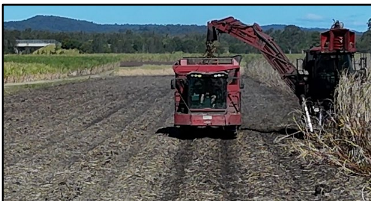
Figure 5. “No-hands” in action

Banks Estate hosted a demonstration this month and invited directors from other harvesting groups. The general sentiment was very positive, with comments on the finishing, and ease of operation. This is a step change in the move towards full controlled traffic... but remember, if your row spacing doesn't closely match the wheel spacing, you'll still get compaction and stool damage, just in a nice straight line!